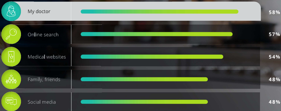
% OF PATIENTS USING SOURCE FOR MEDICAL INFORMATION AND EMOTIONAL SUPPORT

INTERNATIONAL RESEARCH SHOWS THAT PEOPLE LIVING WITH A CHRONIC ILLNESS RELY ON MULTIPLE SOURCES OF INFORMATION BEYOND THAT PROVIDED BY THEIR DOCTOR