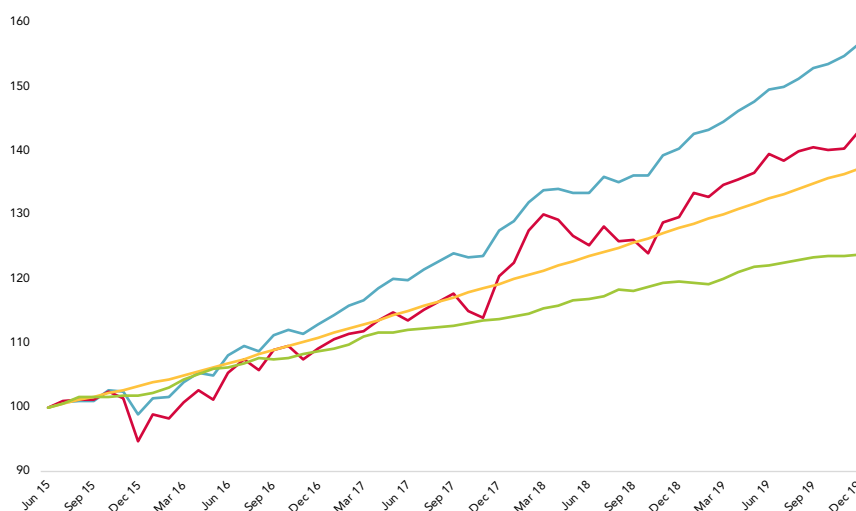
Table of performance